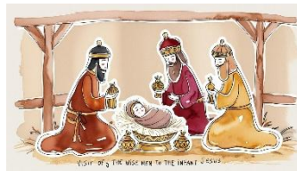
The Magi visit baby Jesus.