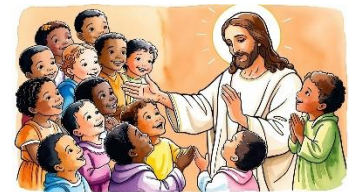
Jesus welcomes and blesses the little children.