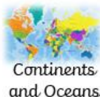
Continents and Oceans