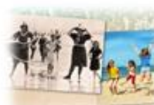
Seasides then and now