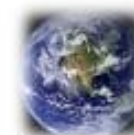
Earth and Space