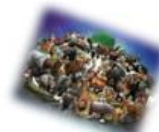
Ourselves and Animals