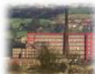
Our Local History