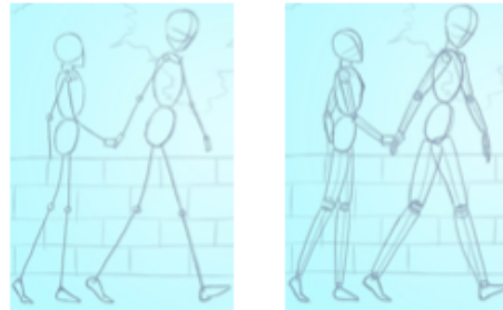
(Left) The ball-and-socket approach

Dürer's woodcut printing technique involved carving an image into a block of wood. Only the lines and shapes of the design are left; all other areas of the wood are cut out with tools such as gouges and chisels. Ink is then applied to the raised surface by dabbing or rolling with a brayer. This image is then transferred onto a sheet of paper by rubbing it against the inked surface of the block or by using a printing press. The image on the block appears in reverse on the paper.