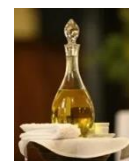
Oil of Chrism