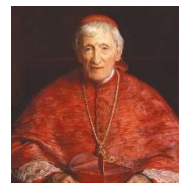
Blessed John Henry Newman