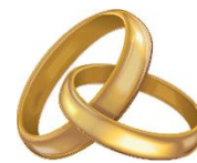
Rings: A symbol of the never-ending love of God.