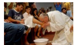
Pope Francis: An example of service